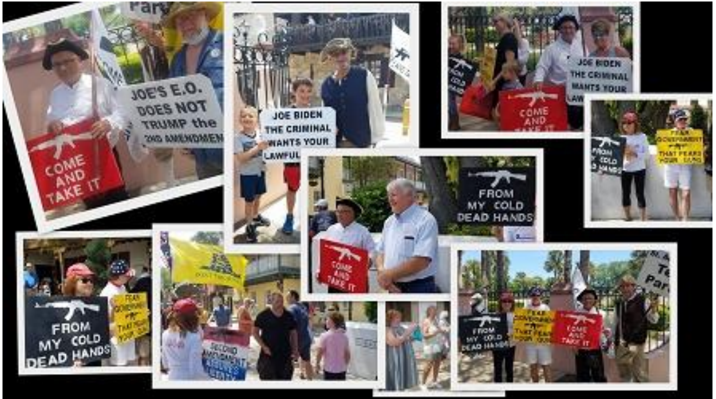
TCCR Staff Photos 4-10-21

In order for Obama's promise to 'Fundamentally Transform America' to occur, the public must be disarmed and that requires the termination of the 2 nd Amendment.