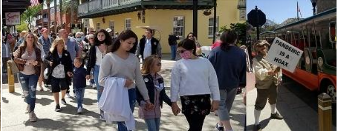
TCCR Staff Photos

The St. Augustine Tea Party has been conducting focus groups in the Historic District since 2011. There's something about the mix of people on St. George Street that makes it possible to gauge the grassroots political thoughts in America. The ideas of "We the People", the "Sovereign Force" under the US Constitution, are revealed.