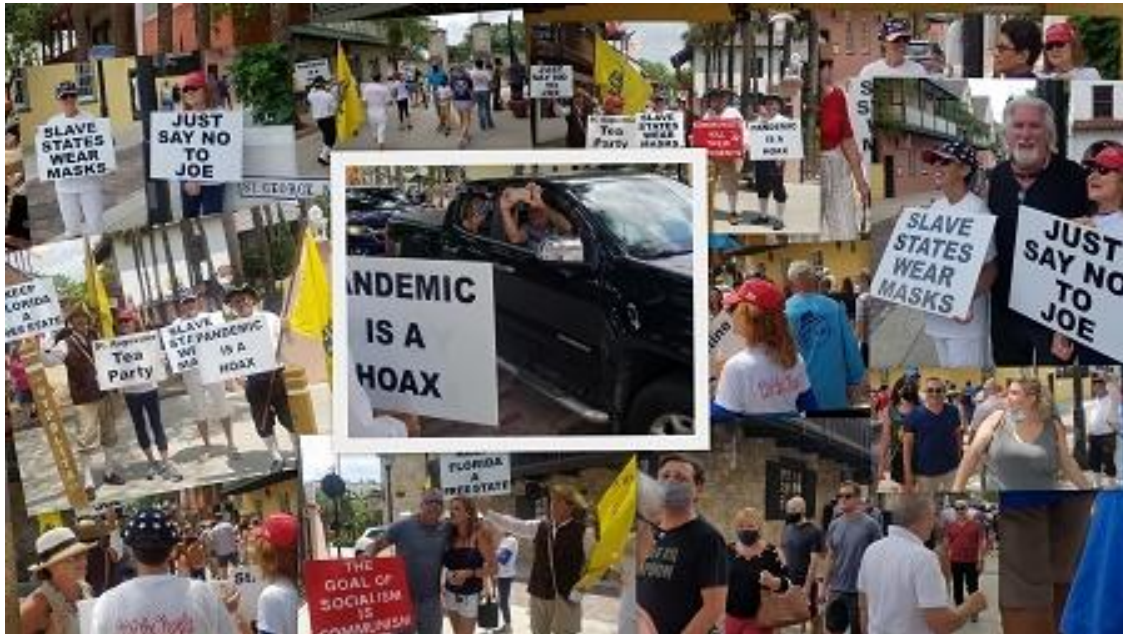
TCCR Staff Photos