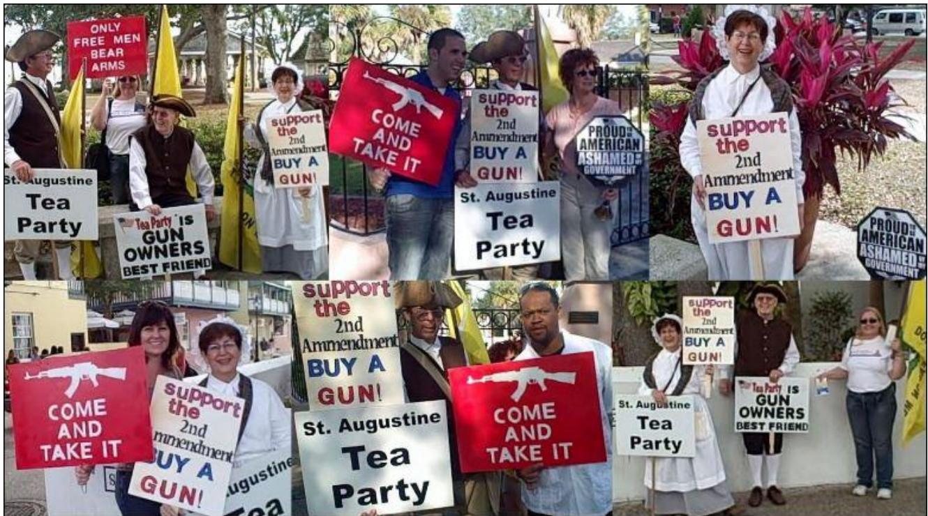
TCCR Staff Photos January 2013

It is important to distinguish between rights and privileges; privileges can be revoked, rights cannot because they come from Nature's universal God. Pertaining to the 2 nd Amendment, it is the natural right of every living creature to defend itself. In the case of human beings, self-defense is accomplished often with the use of weapons. The founding documents acknowledged the right to bear arms for self-defense and in the case of tyrannical lawless government, to replace it with force if necessary.