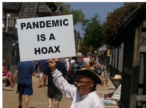
TCCR Staff photo