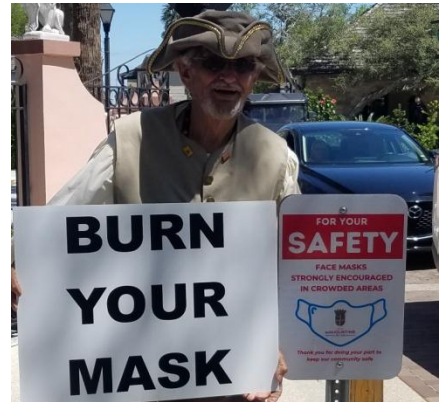
TCCR Staff Photo