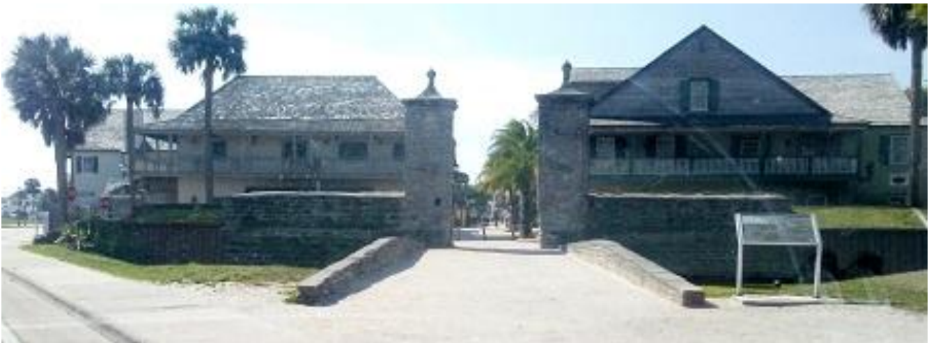
City Gates 3-15-2020

The Oldest City in the USA was closed down last year on Sunday, March 15, 2020 due to the China virus scare. The last St. George Street Poll prior the China Virus shutdown was on March 14, 2020, the day before all shops and restaurants were shut down on St. George Street. That was the day the dragon killed St. George!