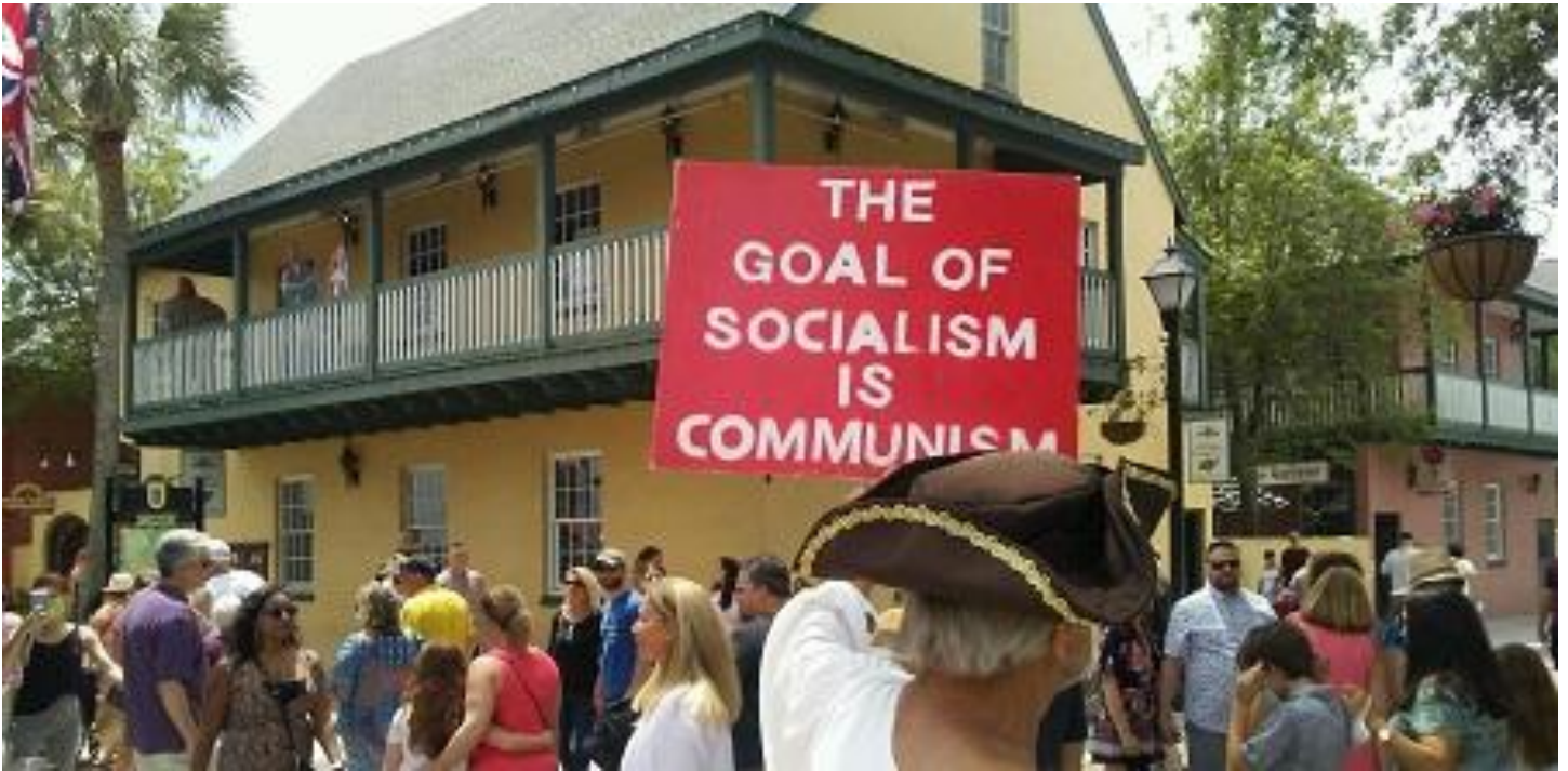
TCCR Staff Photos