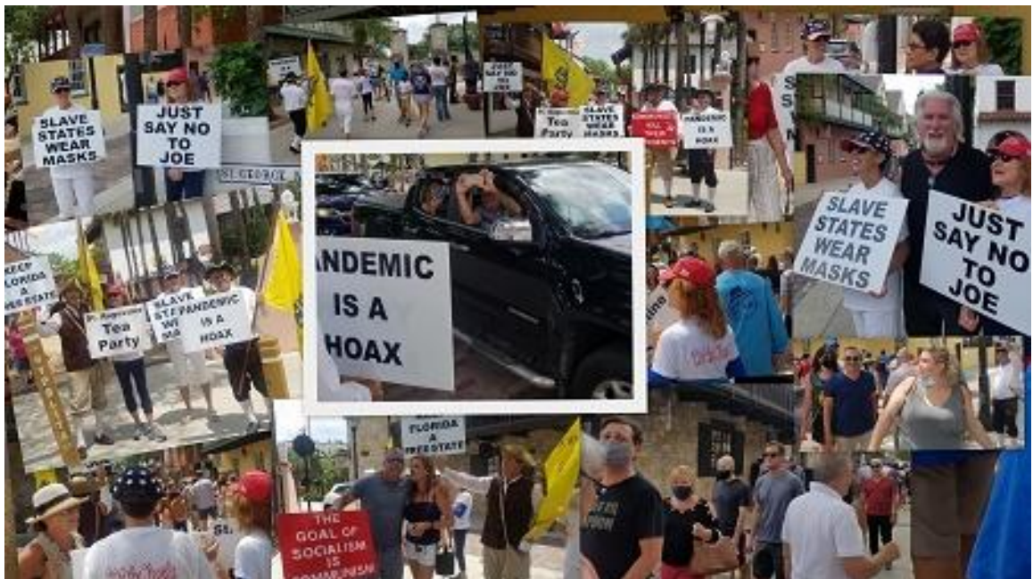
TCCR Staff Photos

Fifth, the commies, elected, appointed or hired, need to be eliminated from public, governmental offices. Now!